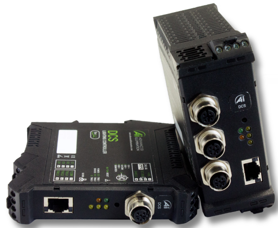
DCS-100E and DCS-103E Shown