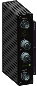
FOR REFERENCE ONLY